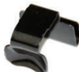
CL-M05 x 2