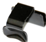
CL-M05 x 4