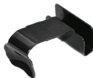
CL-M11 x 4