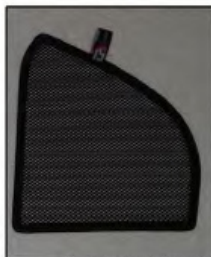
SMALL SIDE WINDOW X2