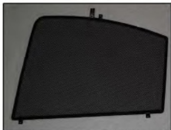
SIDE WINDOW X2