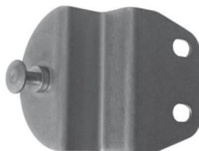
4. Side door fixing plate