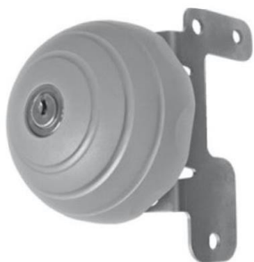
3. Side sliding door plate