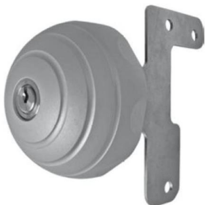
1. Right side rear door plate