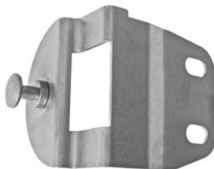
2. Rear door fixing plate left side